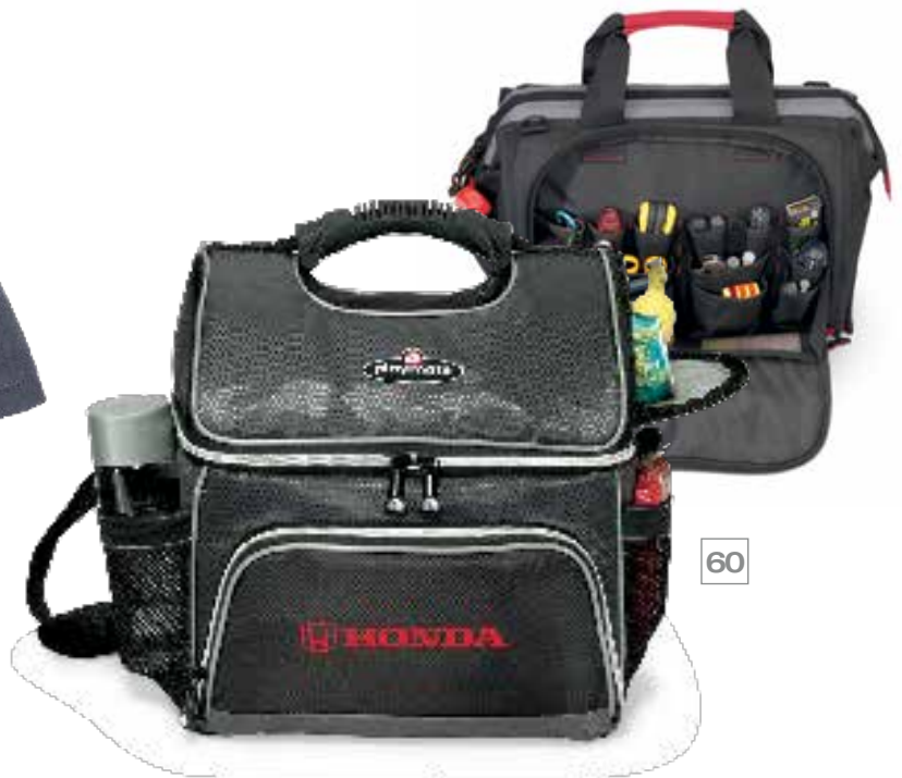
61. RACE-DAY PIT CREW TOOL BAG 200196850

Large main compartment with bottom insert for extra support. Front zippered compartment with multi-purpose organizer. Padded, adjustable shoulder strap and top grab handles with dual side pockets. Tape measure clip on side pocket. Tools not included. Honda logo printed in red on front pocket.