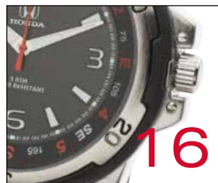
Sport and Leisure