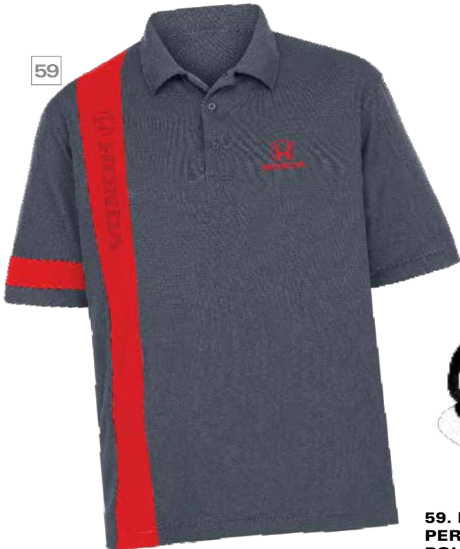
59. RACE-DAY MEN'S PERFORMANCE STRIPE POLO 200196847

Contrasting insert colour stripes. Anti-bacterial, this polo features self-collared and drop tail with side vents. Honda logo laser etched on down the stripe and embroidered in red on left chest. M-XL