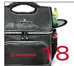
Pit Crew Collection