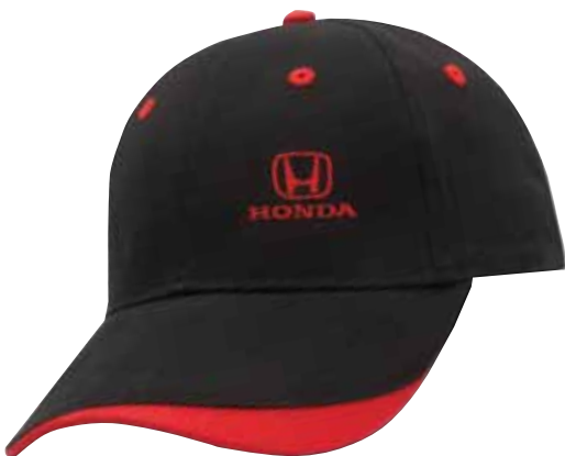
MEN'S BLACK CAP - HD93440 100% cotton chino twill with soft-mesh back panels and fabric Velcro® strap. Honda logo embroidered on front left panel. Suggested Retail Price $8.25