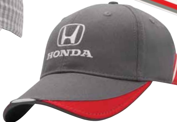
MEN'S GREY CAP - HD93400 Low structured cap with 100% cotton twill sweatband with open back. Honda logo imprinted on inside binding. 3D embroidery of Honda logo on front. Suggested Retail Price $16.75