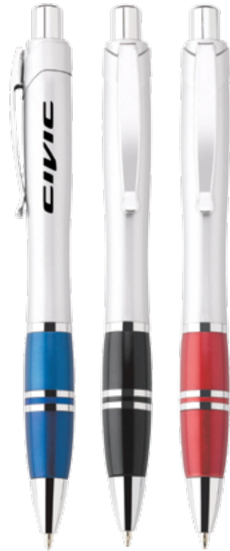
ARCADIA BALLPOINT PEN - HD01330 Push-action plastic pen with satin silver barrel, chrome trim and colored grip with chrome rings. Sold in packages of 5. Assorted colours. Blue ink. Civic logo screened on pen. Suggested Retail Price $6.00