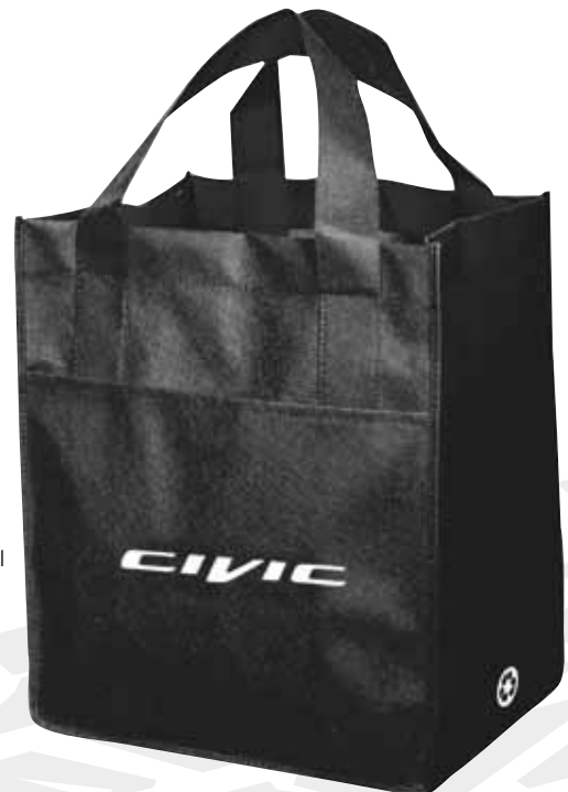
NON-WOVEN CARRY-ALL BAG - HD01380 Non-woven bag with large front slash pocket and two self-material carry handles. Great sized and durable carry-all bag. This one bag replaces two standard sized plastic bags. Civic logo printed on front of bag. Size: 11.75" W x 13.75" H X 8.75" D. Suggested Retail Price $3.00