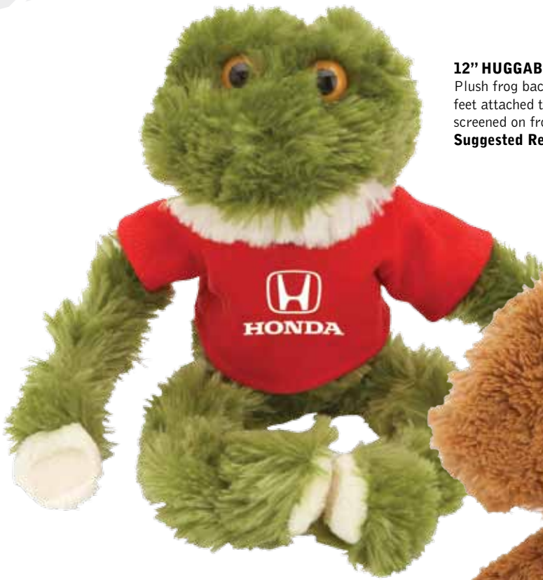
12" HUGGABLE PLUSH FROG - HD00710 Plush frog back by popular demand! Hands and feet attached together with Velcro. Honda logo screened on front of t-shirt. Suggested Retail Price $14.00