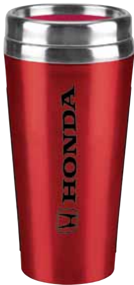
DUAL-GRIP TRAVEL TUMBLER - HD93480 18 oz. double walled stainless steel tumbler with two silicone strip inserts for comfort grip. Honda logo screened vertically on front. Suggested Retail Price $17.00