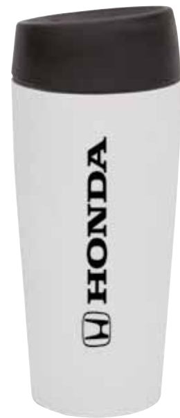
COOL STAINLESS MUG - HD93490 16 oz. stainless steel travel mug with Honda logo screened vertically on front. Suggested Retail Price $12.00