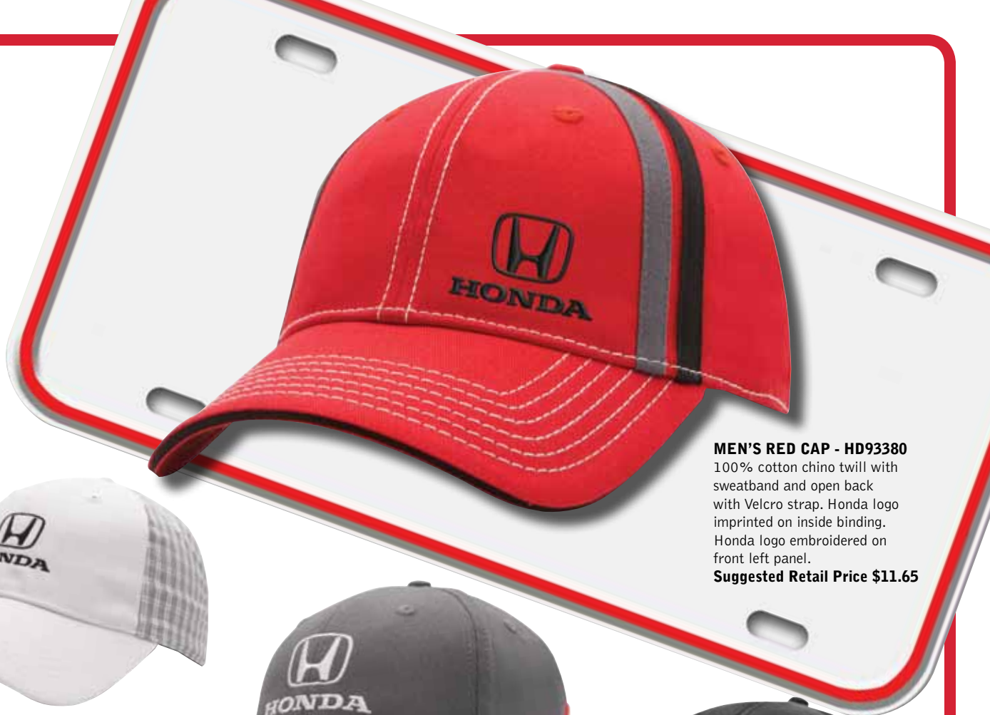
MEN'S RED CAP - HD93380 100% cotton chino twill with sweatband and open back with Velcro strap. Honda logo imprinted on inside binding. Honda logo embroidered on front left panel. Suggested Retail Price $11.65