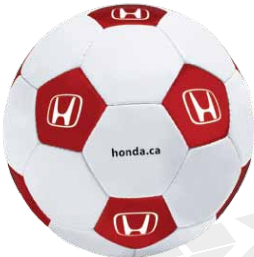
HONDA SOCCER BALL - HD93150 Full size soccer ball. Ships deflated to save space. Honda logo screened on every red diamond. Suggested Retail Price $20.00