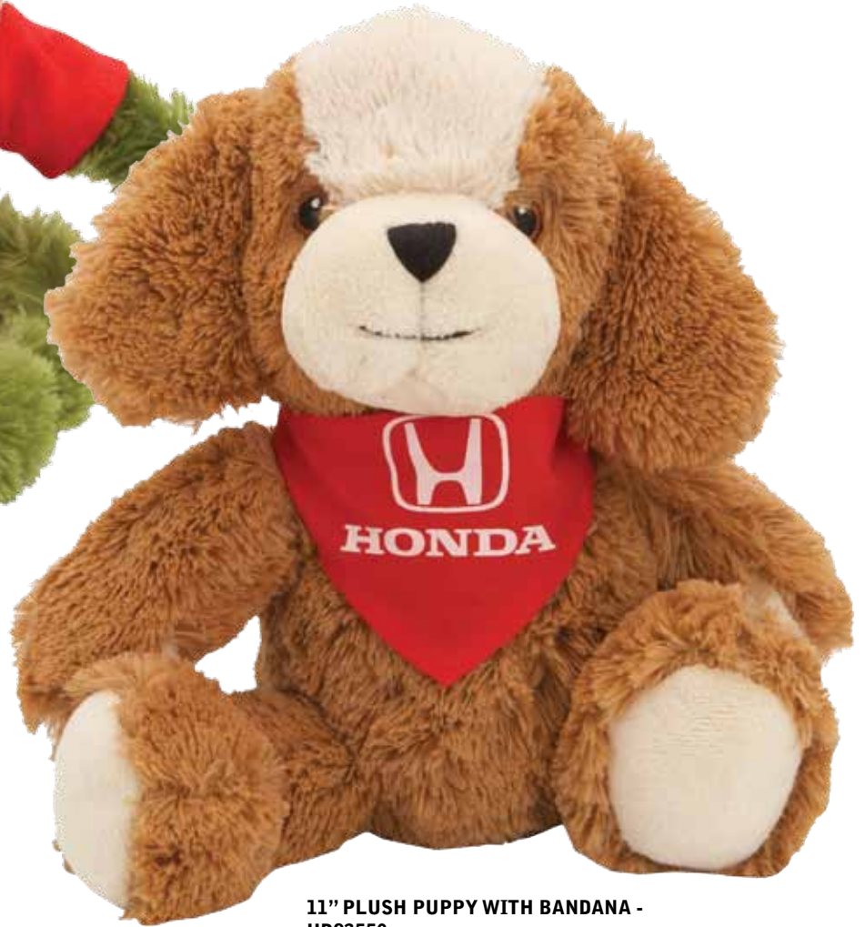
11" PLUSH PUPPY WITH BANDANA - HD93550 Super soft puppy with Honda logo screened on red bandana. Suggested Retail Price $15.00