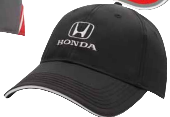
MEN'S TWILL CAP - HD93450 Low structured cap with terry elastic sweatband and closed back. Honda logo embroidered on front. Suggested Retail Price $13.50