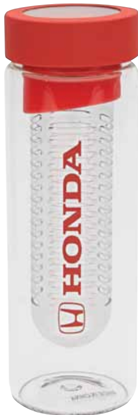
GLASS WATER BOTTLE WITH BUILT IN FRUIT INFUSER - HD93520 Flavour your water with the fruit infuser insert. Honda logo screened vertically on front. Suggested Retail Price $15.00