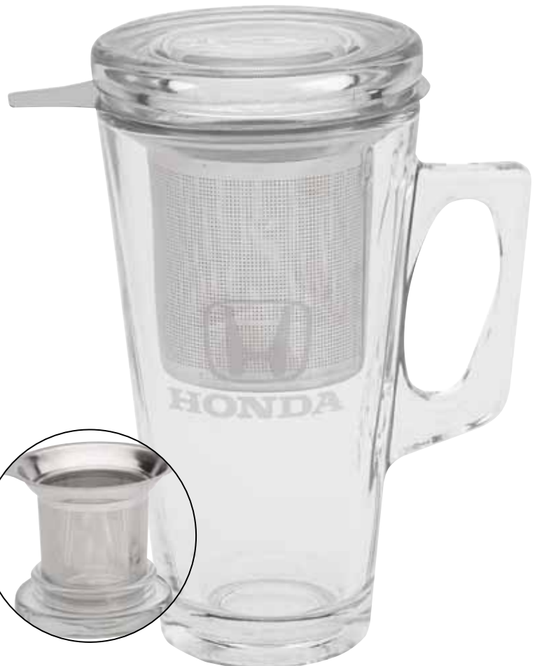
GLASS TEA MUG WITH INFUSER - HD93500 15 oz. heat resistant glass with deep-set stainless steel tea infuser. Comes with glass coaster and gift box. Honda logo satin etched on front. Suggested Retail Price $17.00