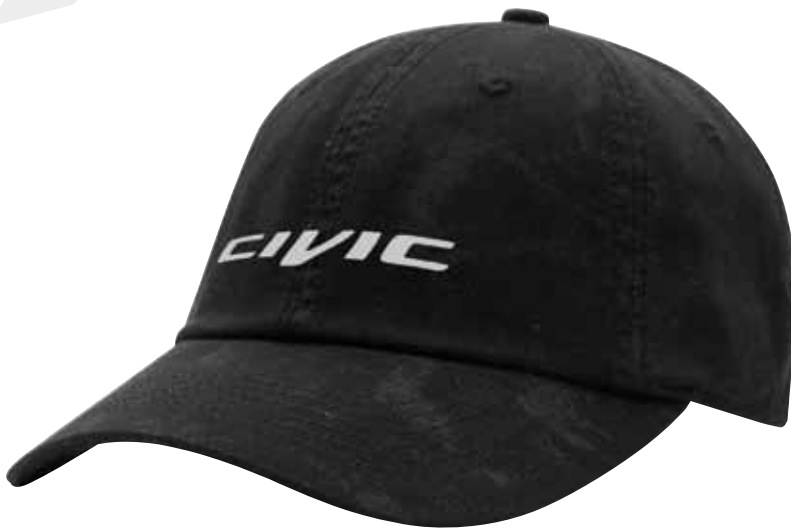
MEN'S FITTED CAP - HD0130 100% heavyweight brushed cotton stretchable fitted cap. Civic logo embroidered centered on front. Available in 2 sizes S/M or L/XL. Suggested Retail Price $11.25