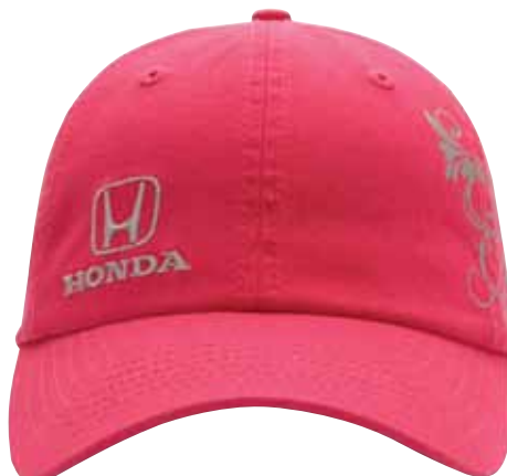
LADIES' FUSHIA CAP - HD93390 100% cotton chino twill cap with a washed finish and a Velcro closure. Honda logo embroidered on front right panel. Floral imprint on side. Suggested Retail Price $12.95