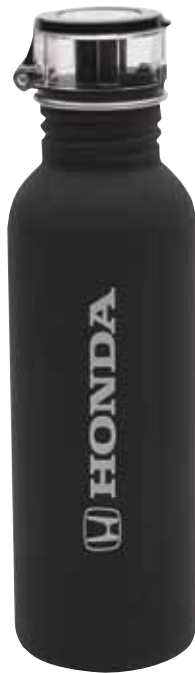
STAINLESS STEEL WATER BOTTLE - HD93510 25 oz. wide mouth twist top stainless steel water bottle. Features a matte black rubberized finish with push button latch and flip top lid that incorporates a flip handle for easy carrying. Honda logo screened vertically on front. Available mid-May 2012 Suggested Retail Price $15.00