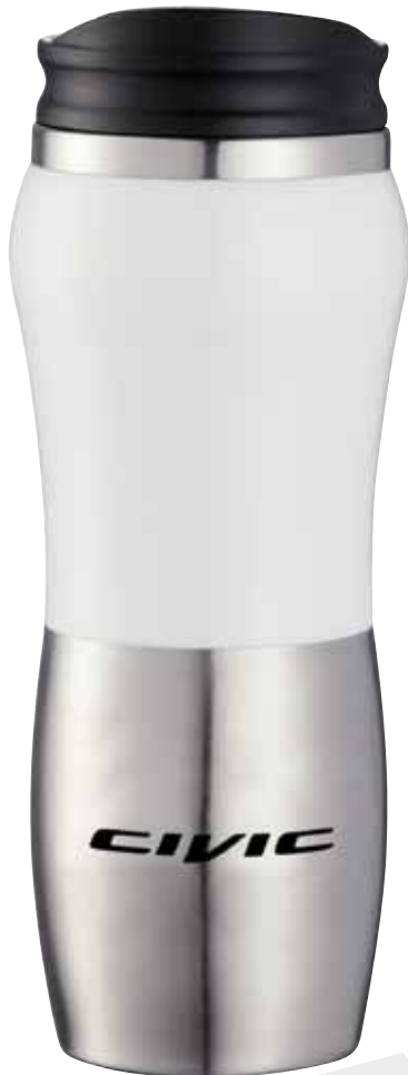
TRAVEL TUMBLER - HD01350 14 oz. (400ml) double wall stainless steel tumbler with acrylic band and thumb-slide lid. Individually boxed. Civic logo printed on front centre. Suggested Retail Price $12.00