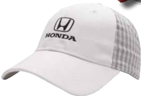
MEN'S PLAID ACCENT CAP - HD93430 Cotton chino twill cap with plaid twill on back of cap with a white Velcro® closure. Honda logo embroidered on front. Suggested Retail Price $12.75